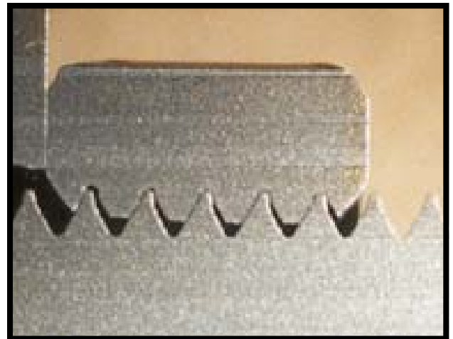
Spring action of the Dual-Angle™ Thread Profile